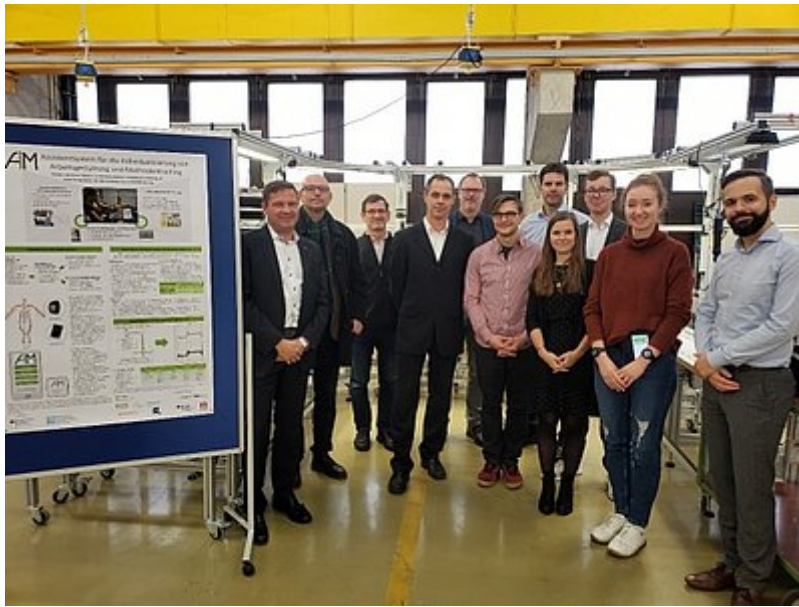
photo above: The PALM4.Q project team at the training center at Leopold Kostal GmbH & Co. KG in Lüdenscheid

photo below: The AIM project team at the final event at TU Dortmund University