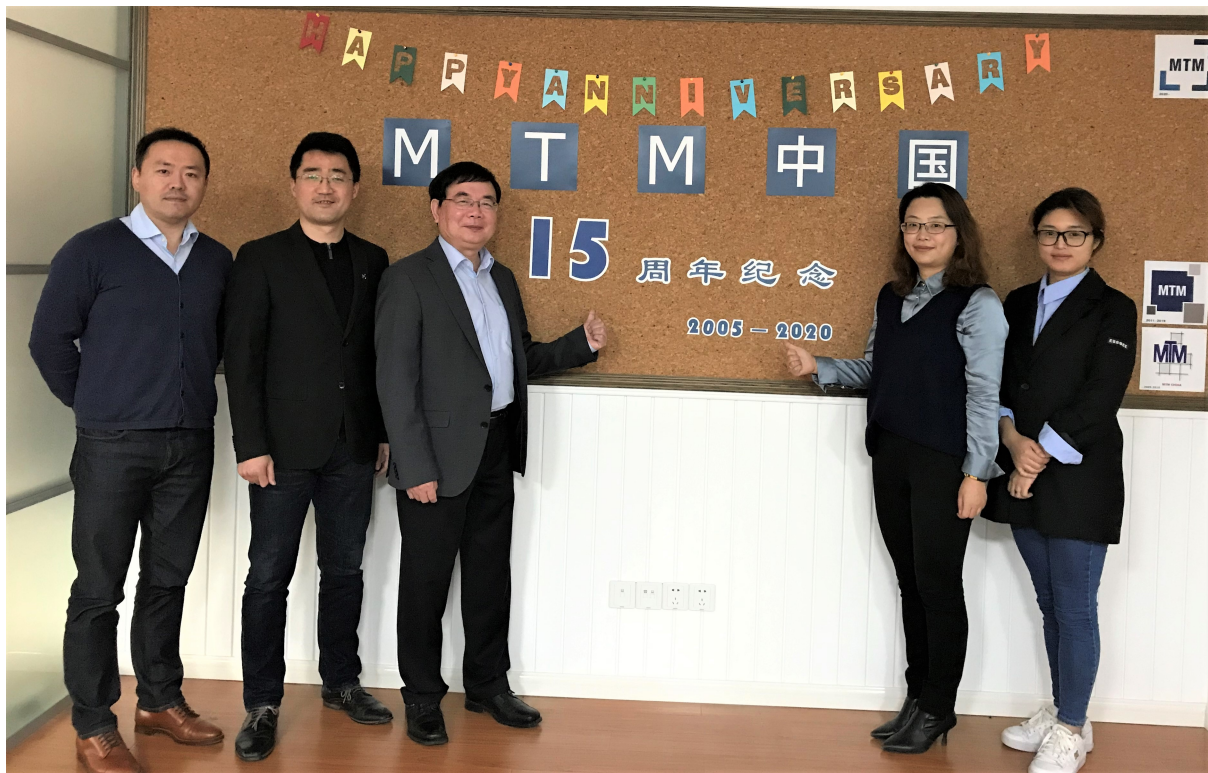
Picture 1: The team of MTM China met for the 15th anniversary in the company premises in Shanghai.