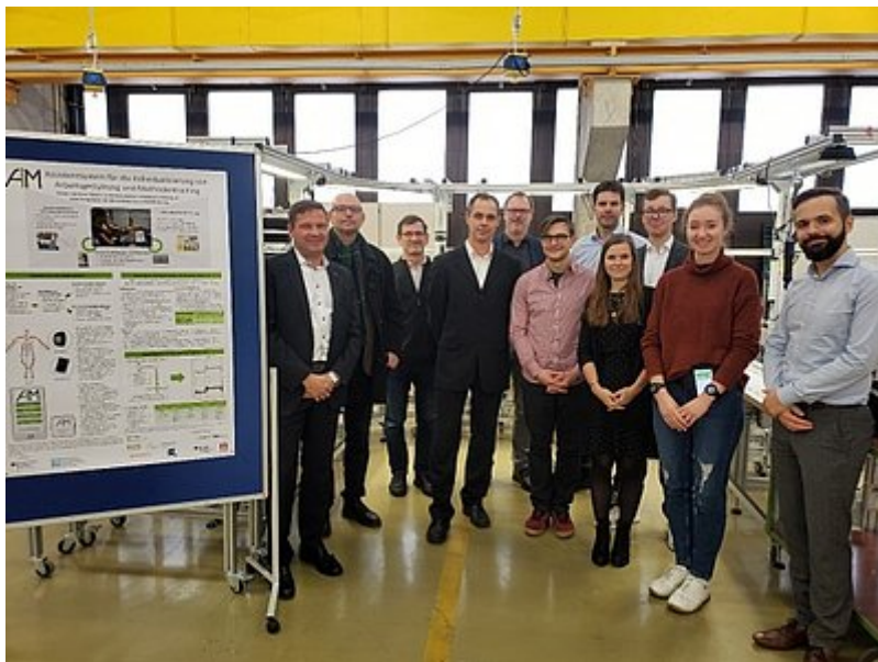
photo above: The PALM4.Q project team at the training center at Leopold Kostal GmbH & Co. KG in Lüdenscheid